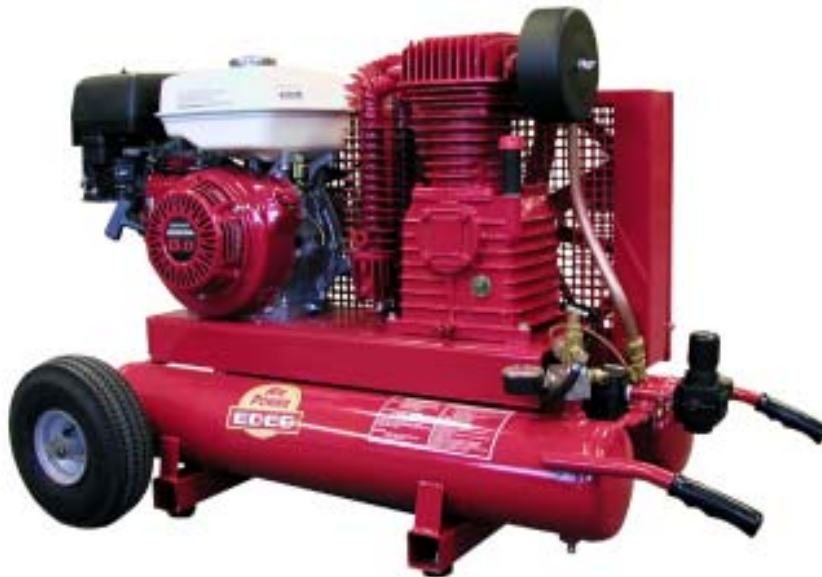
Portable Air Compressor Part No. 95300